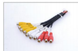
Audio and video line