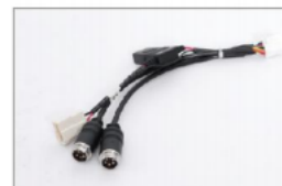
Equipment function line