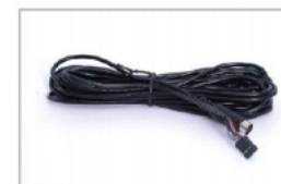
9P data line