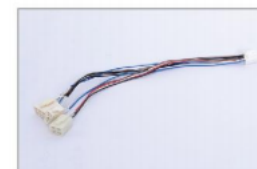
Power video Adapter 2