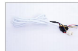
Equipment power cord