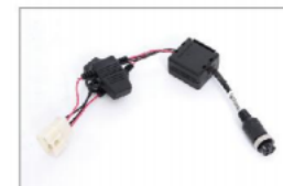
Video recorder power cord