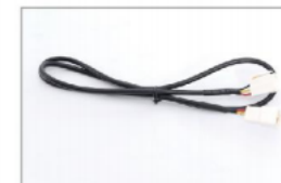
Equipment data line