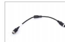
Video Magnification Adapter