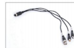
Video adapter cable