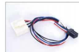
Power video Adapter