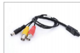
Audio and video adapter cables