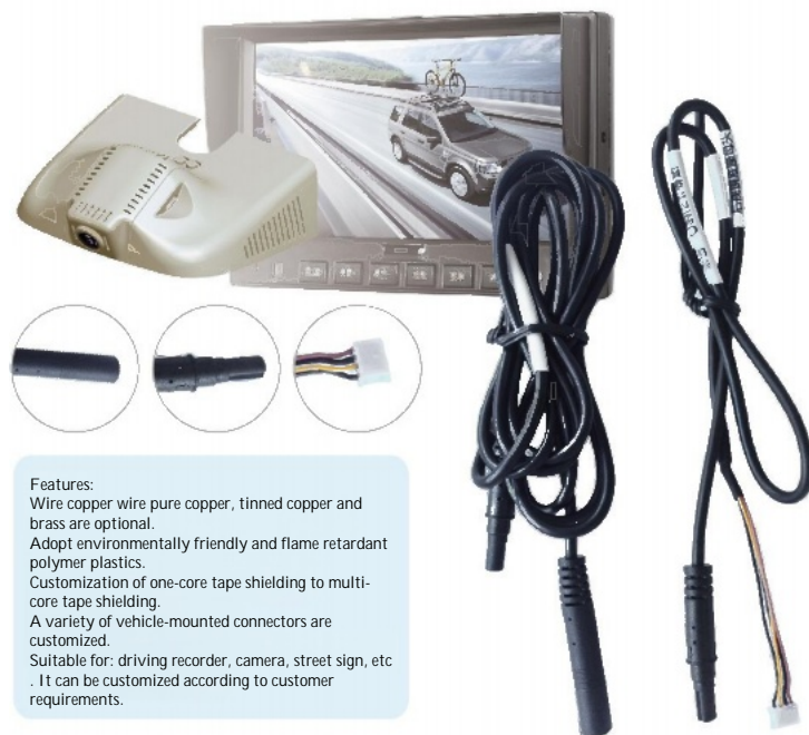
Bmw 4P function line