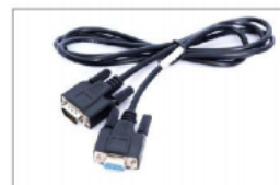
DB9 signal line