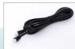
5557 signal line